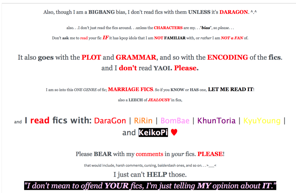
Figure 1. A selected part of a profile page introducing a page owner in Asianfanfics.

In the first and second lines of Figure 1, the word “bias” is used several times. This is a common word among English speakers, but its situated meaning in the specific Asianfanfics social space—which is different