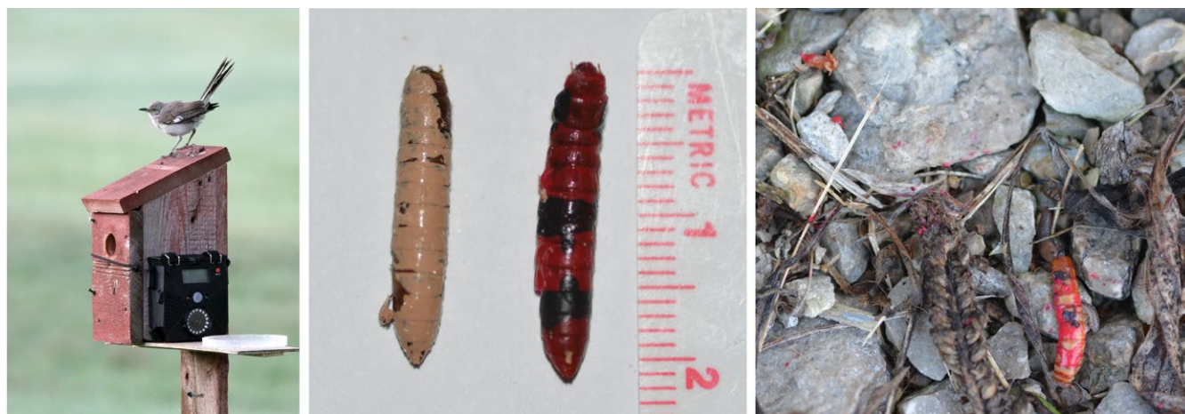
FIGURE 2 (left) Photograph of the feeding station with a mockingbird ( Mimus polyglottos ) perched on top. (middle) Painted mealworms used to test the role of aposematic coloration found in Dasymutilla occidentalis during interactions with free-ranging birds. (right) Photograph of an aposematically painted mealworm that was struck at by a mockingbird and “decapitated” but not consumed

On “test” days, behavioral observations were conducted from a deck located 10 and 20 m from each of the respective feeding stations. A Nikon spotting scope (15–45×) and Bushnell 7 × 50 handheld binoculars were used to observe the feeding stations. The procedure on test days consisted of placing the appropriate experimental subject (see below) in the Petri dishes at 07:00 hrs and recording observations for 40 min. We recorded the species of bird visiting the feeder, the general behavior of the bird toward the subjects in the dish, the type (control or experimental animal) and number of experimental subjects struck at, and the type and number of experimental subjects consumed. A minimum of two training days followed each