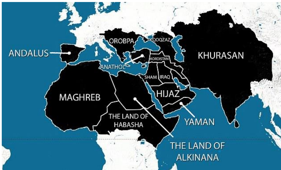
Figure 1 is a map showing ISIS’ long term ambition for taking over the Muslim world.

The objective of ISIS is to create and control an Islamic State over all Muslims, imposing its version of Sharia law and establishing centralized governance. ISIS announced in June 2014 the formation of the Islamic State and named Abu Bakr al-Baghdadi the caliph to whom all Muslims owe their loyalty. In the announcement they declared that, “The legality of all emirates, groups, states, and organizations, becomes null by the expansion of the khilāfah's authority and arrival of its troops to their areas.” 8