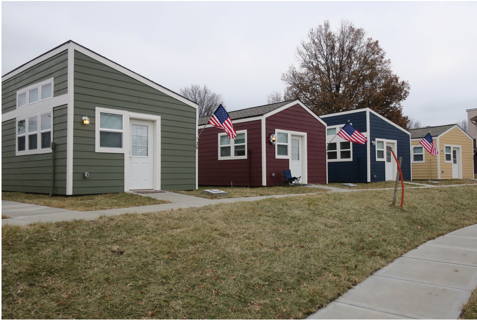
Figure 1 One of many recent tiny house villages for the homeless, Veterans Community Project, located in Kansas City, Missouri, recently opened to serve homeless veterans.

2018). Proponents assert that stable housing is needed for homeless people to address issues such as job placement or addiction issues (Desmond 2016; Padgett, Henwood, and Tsemberis 2016; Keable 2017). These supportive housing models are especially beneficial to the “chronically homeless” (Brown et al. 2016). The chronically homeless comprise 24 percent of the total population of homeless individuals and are defined as individuals having a disabling condition who have been on the streets a year or more or have had at least four episodes of homelessness in the last three years (Brown et al. 2016; National Alliance to End Homelessness 2018).